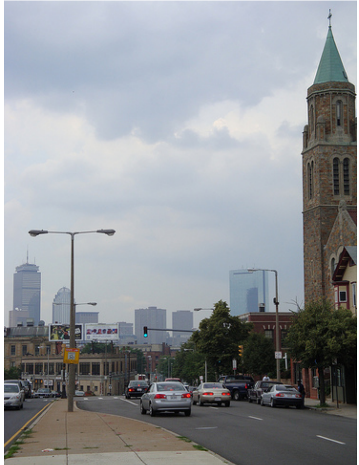
View from Warren Street in Roxbury

As part of team, Planners Collaborative analyzed land use and development impact issues, the socio-economic characteristics of the community, urban design and streetscape improvements, pedestrian safety needs at major intersections along the Columbus Avenue corridor, and signage needs. In examining the major development proposals in and adjacent to the community, Planners Collaborative supported the project team for preparing a build-out analysis. This build-out analysis was then used to test different growth scenarios, their potential impact on traffic in the corridor, and steps that could be taken to control the associated impacts.