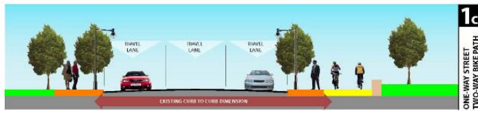
1c ONE-WAY STREET TWO-WAY BIKE PATH