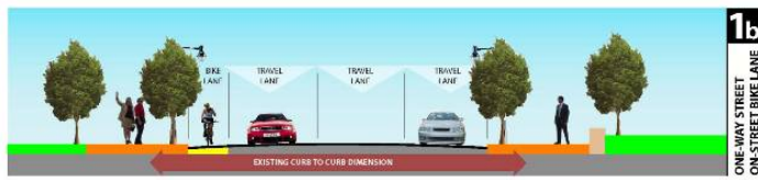
1b ONE-WAY STREET ON-STREET BIKE LANE