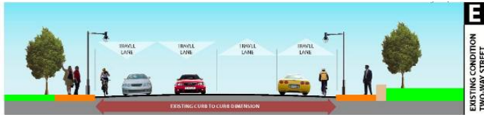
E EXISTING CONDITION TWO-WAY STREET